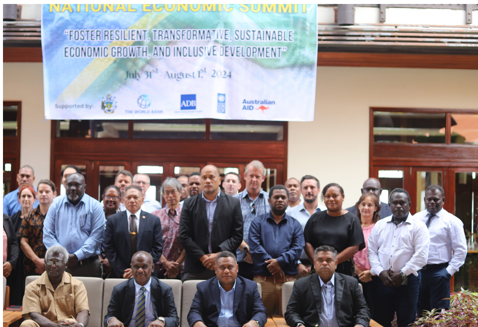
PM Jeremiah Manele second from Left with Officials who attend the summit

Solomon Islands Chamber of Commerce and Industry [SICCI] has made it clear that the private sector needs proper infrastructure to grow.