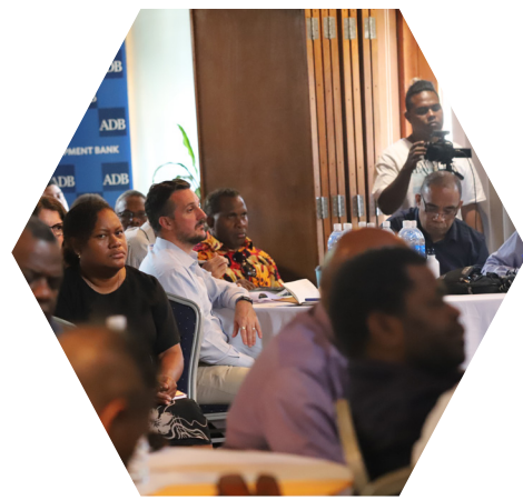
Officials listening to presentations