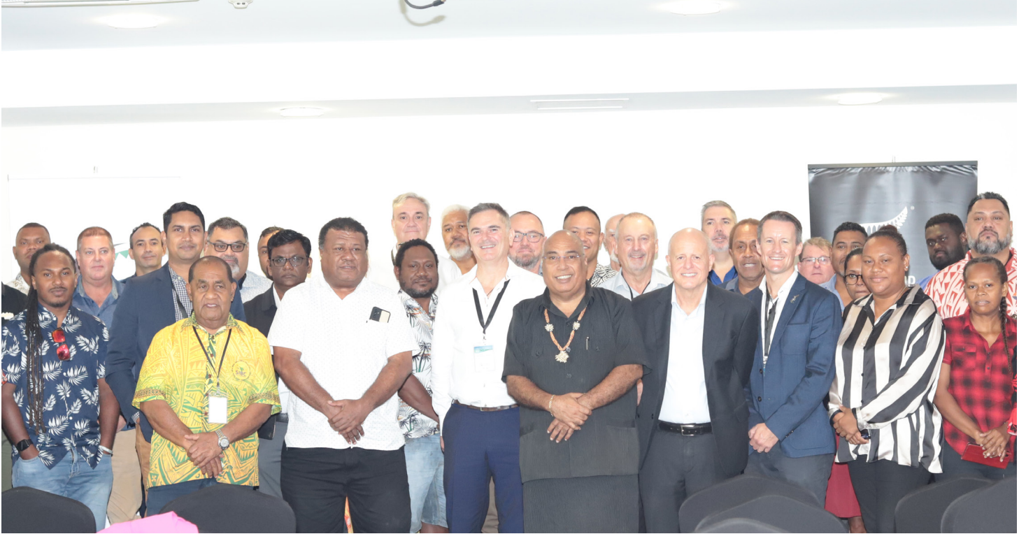
Officials and SICCI members pose for a group photo

Honiara, June 12, 2024 - The Chamber host the New Zealand Pacific Business Council Forum for the first time in Honiara.