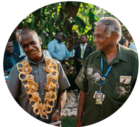
PM Hon Jeremiah Manele and SPM