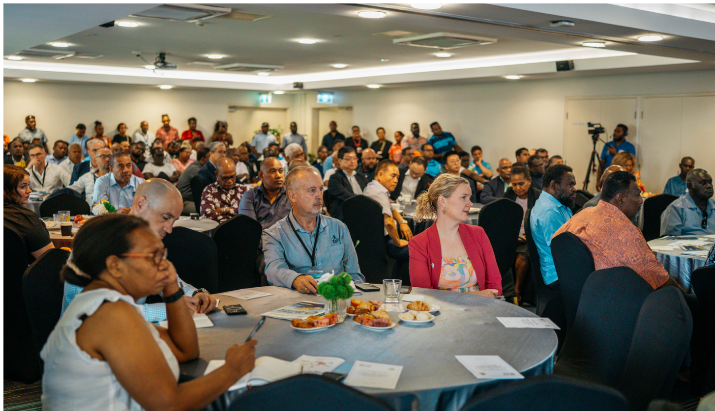
Guests who attend the PM's Breakfast

Honiara, June 13, 2024 — The Solomon Islands Chamber of Commerce and Industry (SICCI) proudly co-hosted with the Office of the Prime Minister, the highly anticipated 2024 Prime Minister's Breakfast this morning.